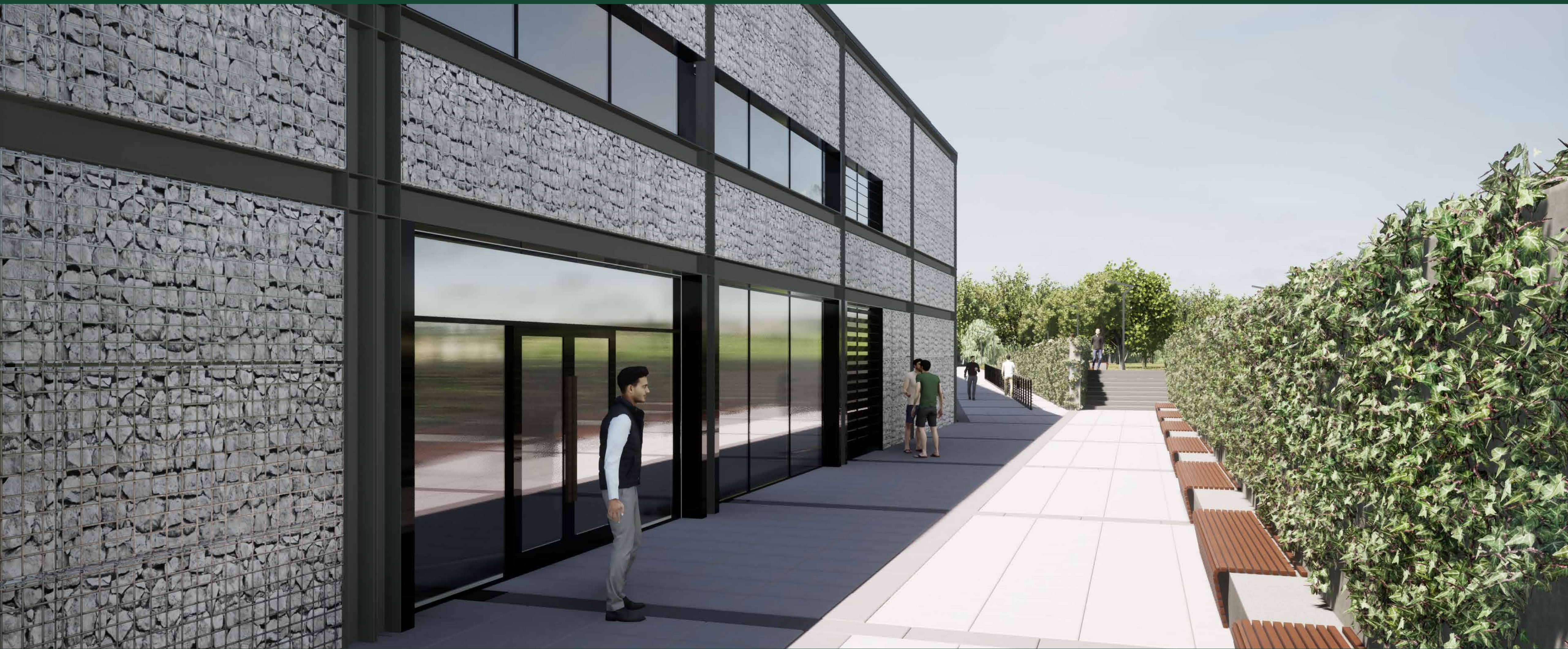
MEMORIAL | visualisation – main entrance