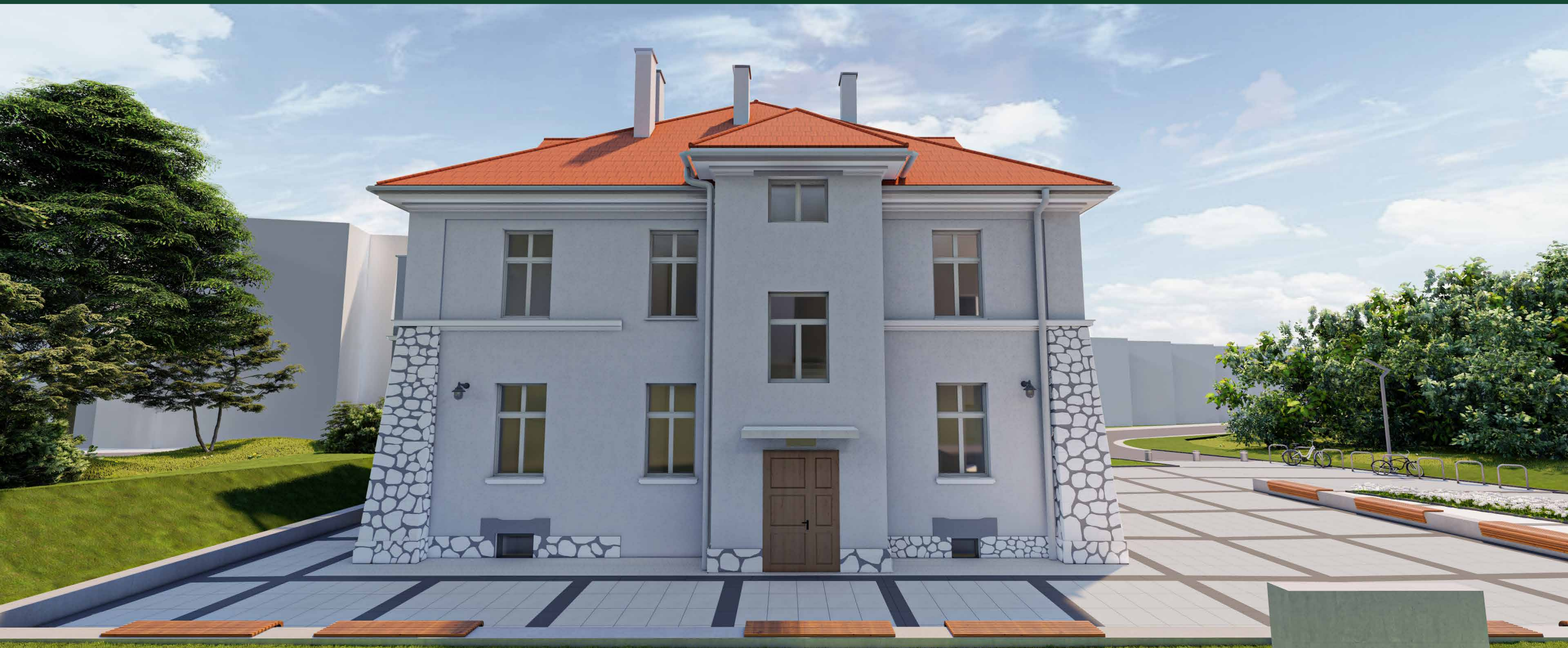
THE GREY HOUSE | visualisation – main entrance