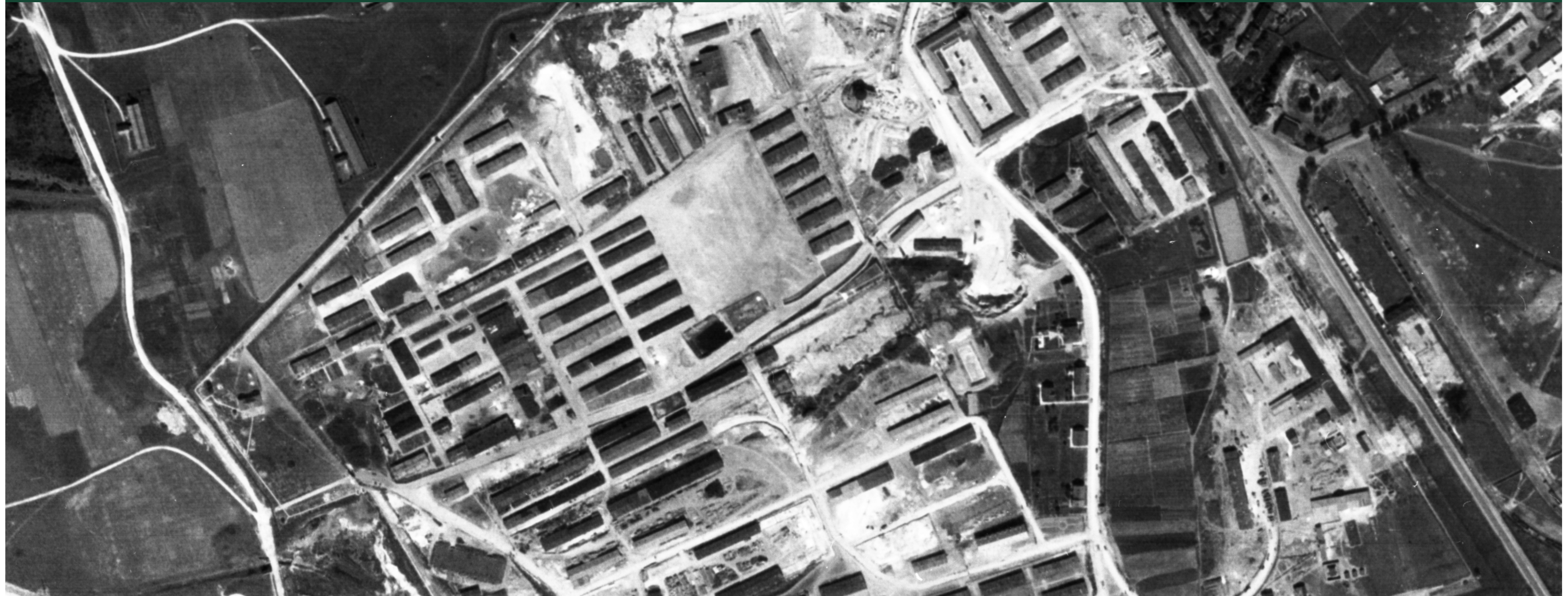
CONCENTRATION CAMP PLASZOW | an areal view dated August 1944