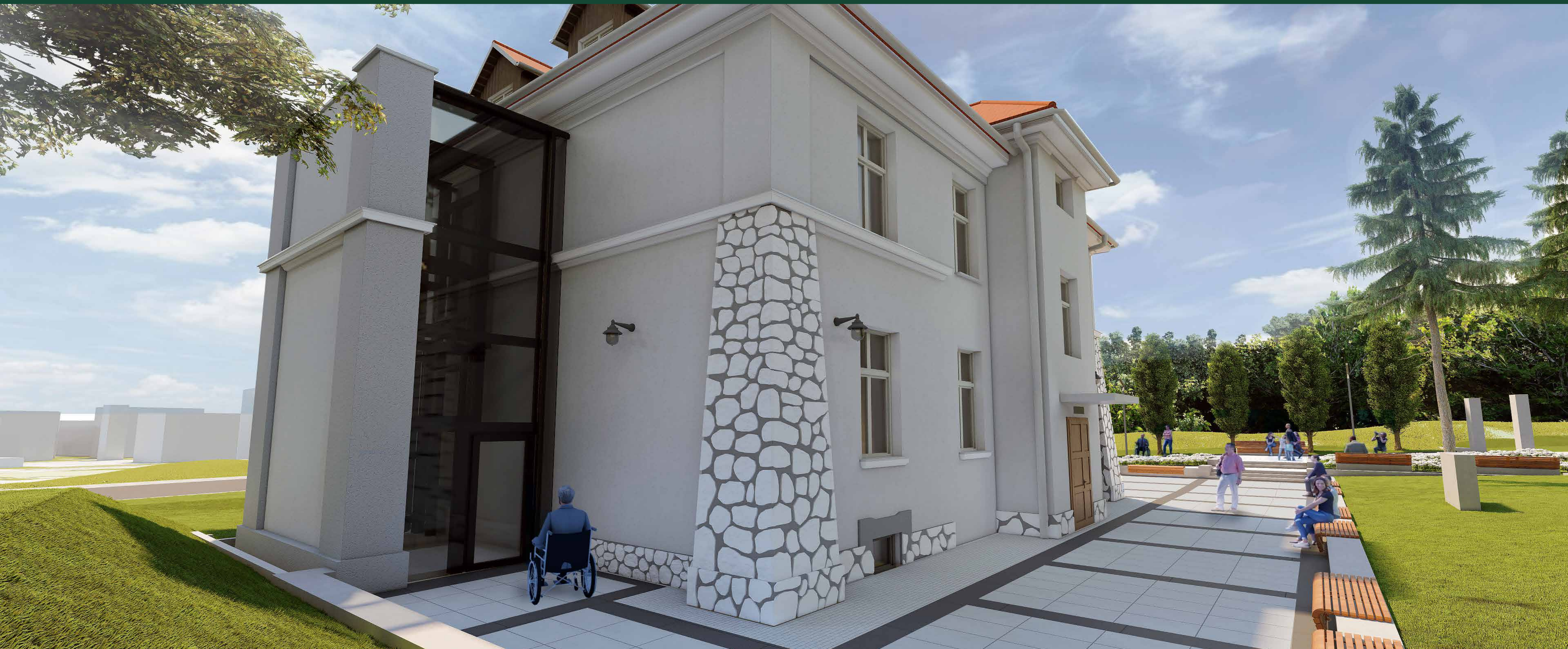
THE GREY HOUSE | visualisation – northern entrance with planned lift shaft