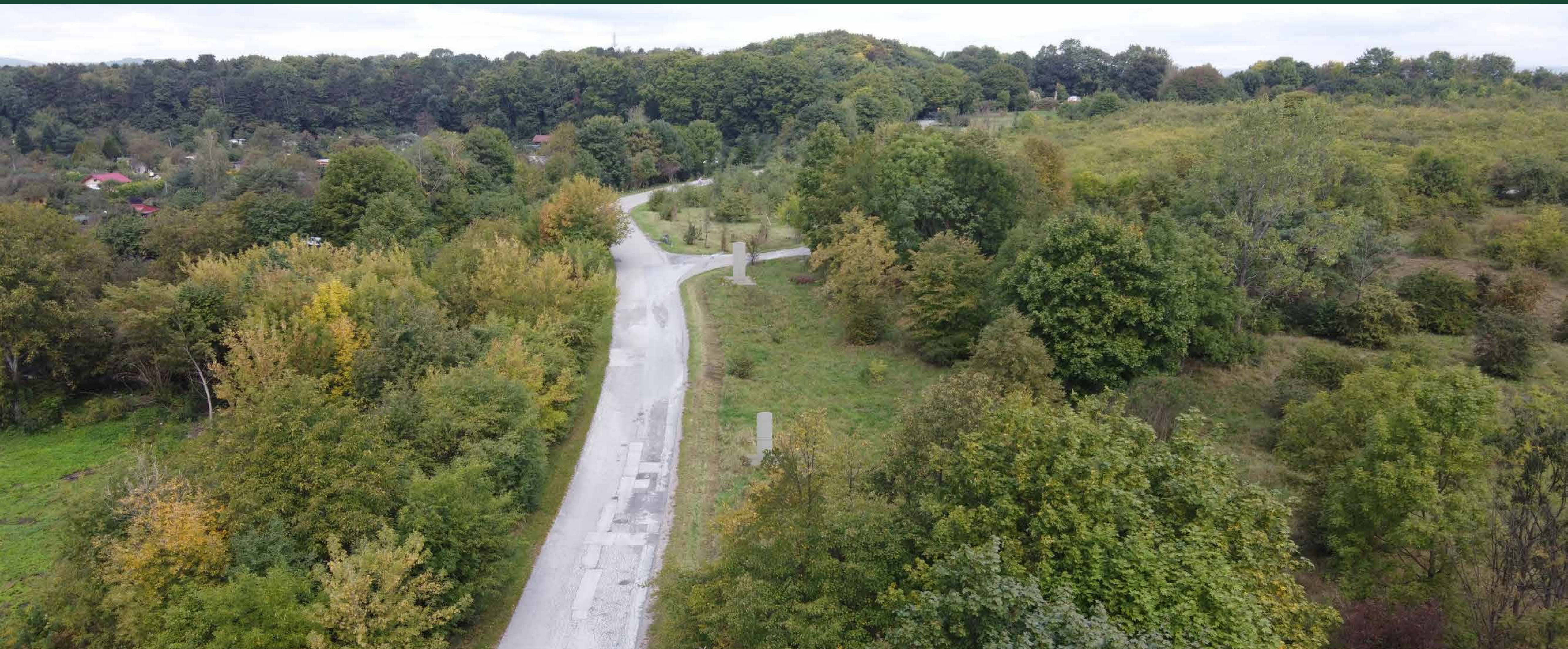
FORMER KL PLASZOW AREA | visualised markings of memorial site boundaries, Swoszowicka street