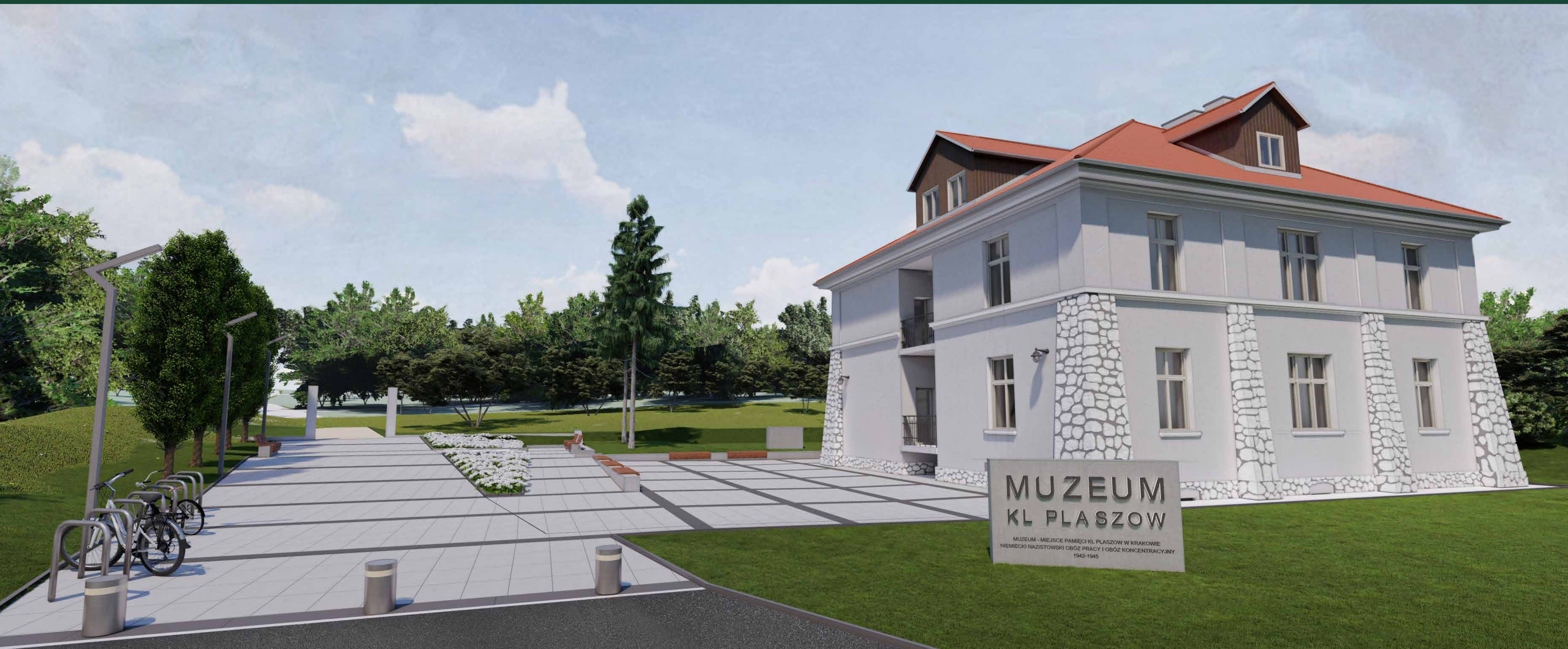
THE GREY HOUSE | visualisation – view from Jerozolimska street