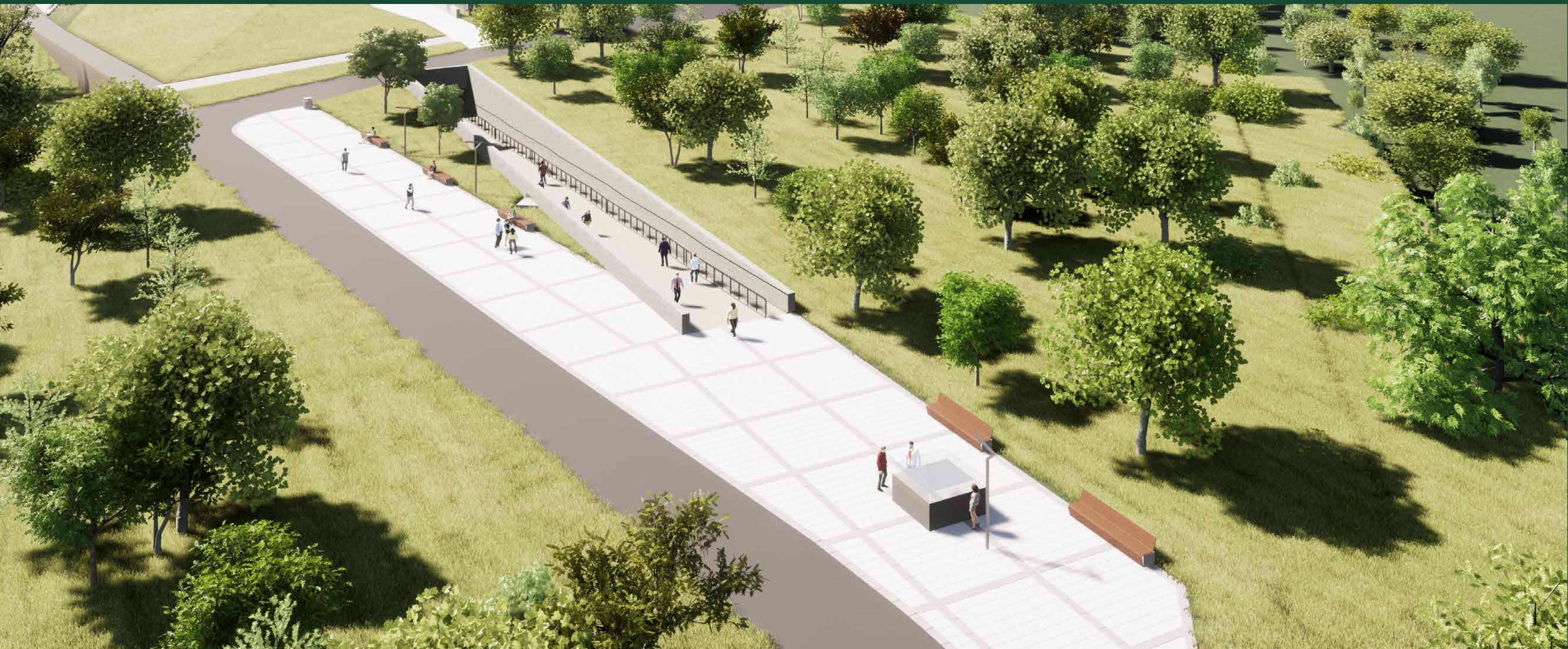
EXIT TUNNEL | visualisation – exit tunnel from the museum and square at Swoszowicka street