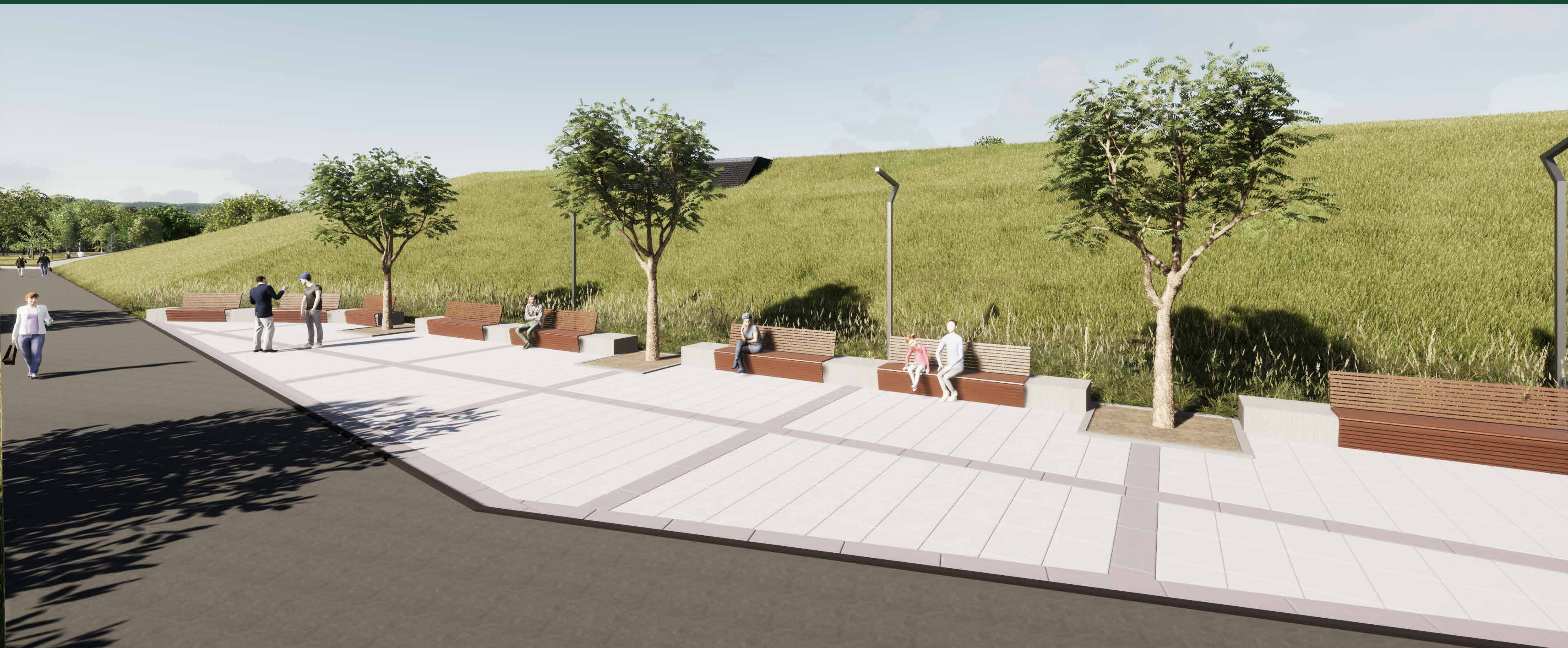
MEMORIAL | visualisation – a view from the south