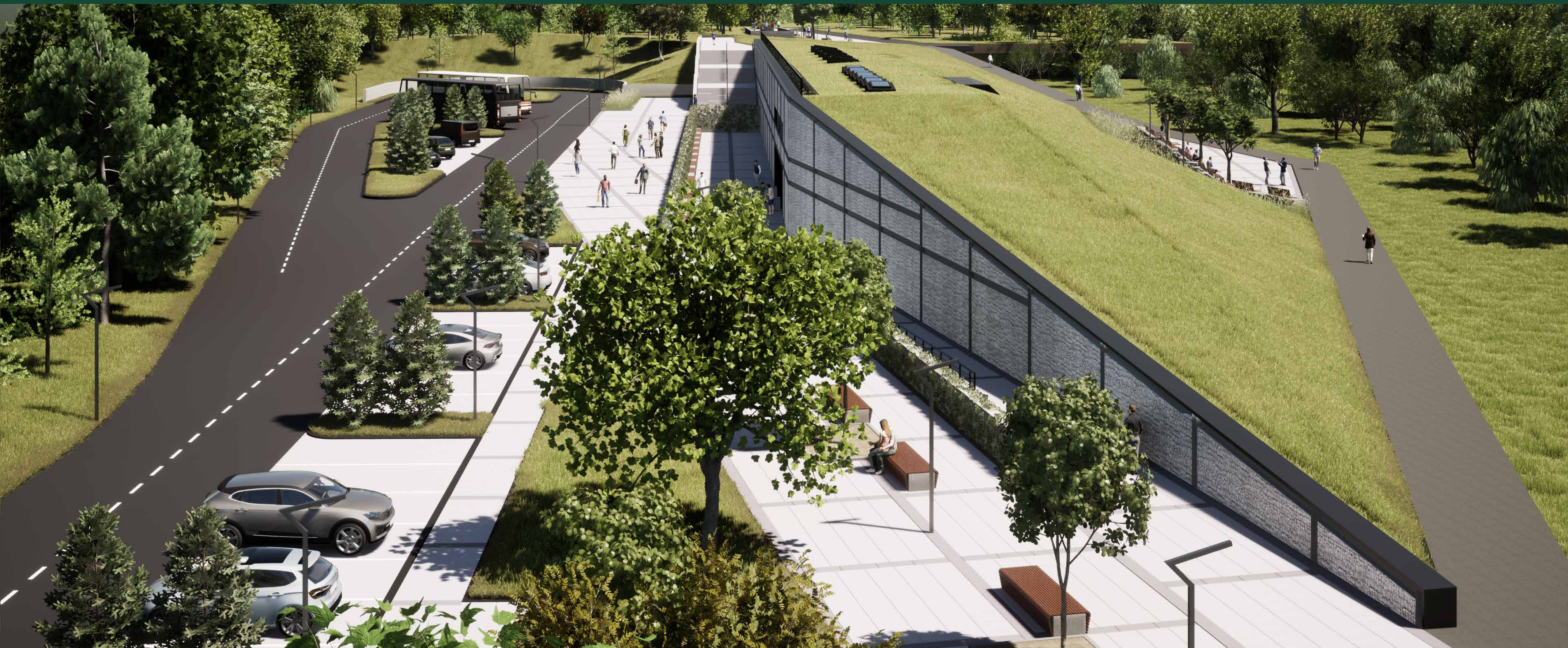
FORMER KL PLASZOW AREA | visualisation – a view from Kamińskiego street